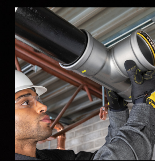
Available 1/2" to 4"